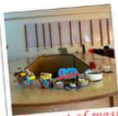
Best out of waste competition