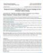
Design and Analysis of Modified AC to DC Converter Topology for Fast Electrical Vehicle Charging